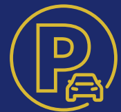
FREE PARKING ON SITE