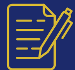
FREE WILL WRITING SERVICE

Staff can work across our family of schools, enabling our academies to benefit from wider expertise and to offer individuals fresh opportunities. Quality of life outside work significantly shapes the way in which people perform, so the need to achieve a healthy work/life balance is an important aspect of our commitment to staff.